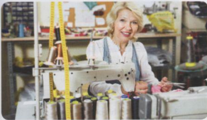
At this club you can make a new teddy bear / fix an old teddy bear.

2 14 Listen and circle the correct answer.