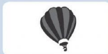
3 Look at that beautiful _____.