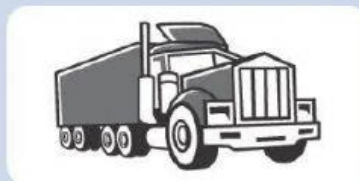
5 Joe's dad drives a _____ for his job.