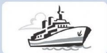
4 My grandparents took a _____ to Barbados.