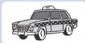
2 We took a yellow _____ in New York.