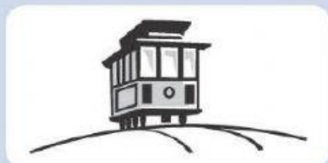
1 I love taking the trolley in San Francisco.

cruise ship hot air balloon scooter taxi trolley truck