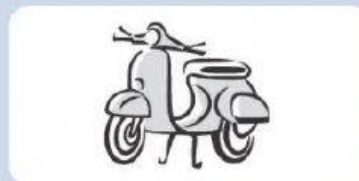
6 My brother got a _____ for his sixteenth birthday.