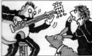
1 He can't play the guitar.