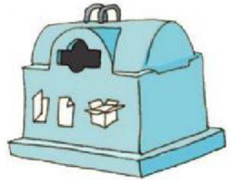
3. paper and cardboard