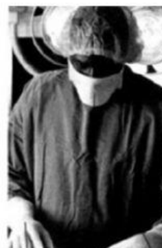
glove mask gown

Surgery is carried out in an operating theatre . Great care is taken to make sure that operations take place in sterile conditions – free from microorganisms. The surgeon and his or her assistant wash or scrub up , and put on surgical gowns, masks, and gloves . The patient's skin is prepared by disinfecting it with an antiseptic solution. This is known as prepping (preparing) the patient. They are then covered with sterile drapes , so that only the area of the operation is exposed.