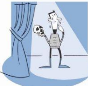
3 the actor / forget what to say _____

Has the bus a just arrived outside the theatre b _____? (just)