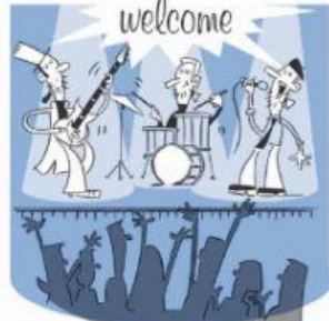
1 the concert / start _____