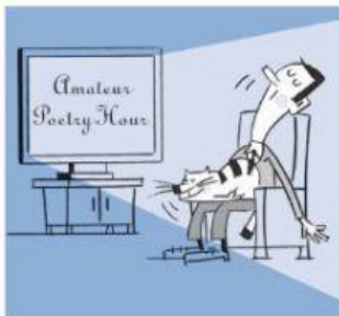
2 Dad / fall asleep _____