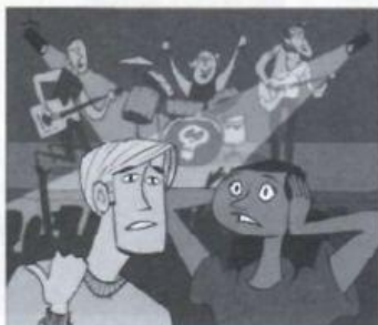
1 Let's go home.

Let's go home. Let's go there. Let's not eat here. Let's open the window. Let's sit here. Let's stop here.