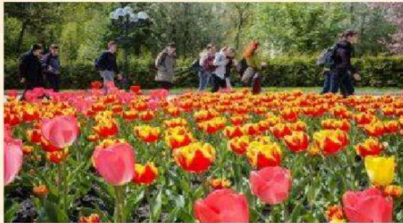
People walk past bloomed tulips in a park in central Kiev, Ukraine on May 3, 2019.

Look at the picture below to answer the questions numbers 8-9