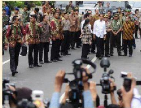
Indonesian President Joko Widodo, center, in white shirt, visits the site of a bomb blast at Tamrin business district in Jakarta, Jan, 14, 2016