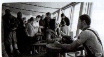
c. At the Snowdon Mountain café