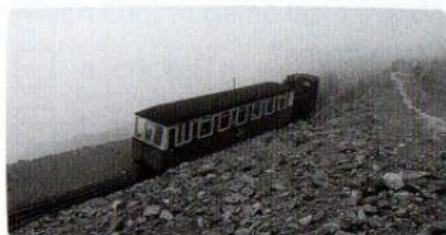
a. At Snowdon Mountain Railway

Watch Scene 6 and choose the right situations (a–d) for the following sayings.