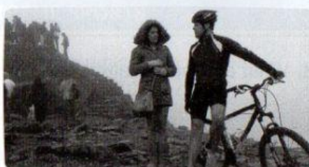
d. On the Mountain Summit