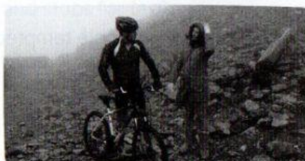
b. At the top of the Mountain