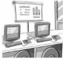
0 IT room

IT room library sports hall playing field science lab canteen