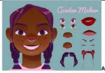
online representation of myself