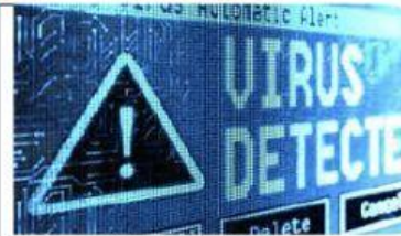
A computer virus