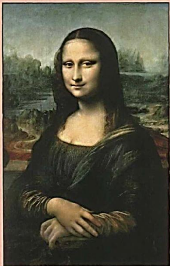
▼ Mona Lisa , Leonardo da Vinci, c.1503–19