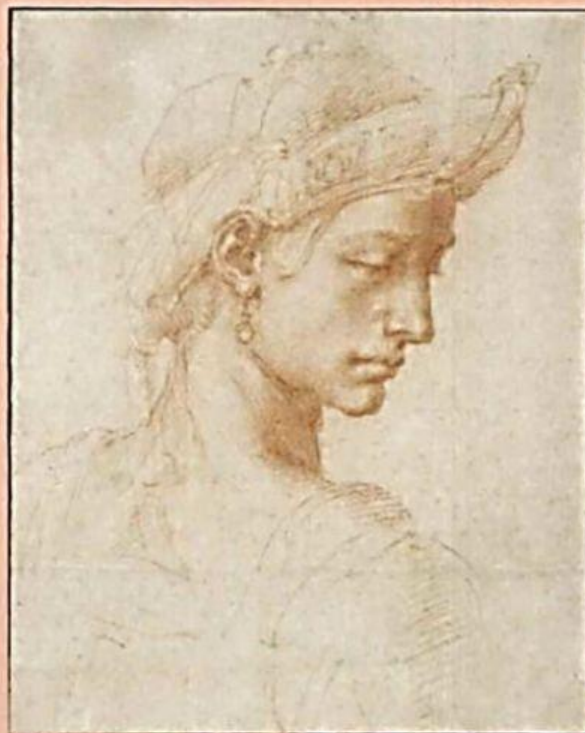
▼ Ideal Head , Michelangelo, c.1518–20

UP CLOSE! As you walk past, you feel her eyes looking straight at you.