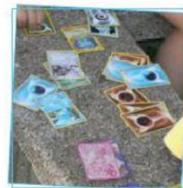
I play cards