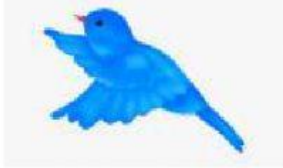
THE BIRD CAN...