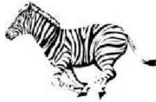
THE ZEBRA CAN...