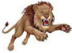
THE LION CAN...