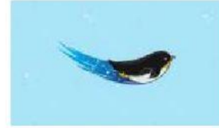
THE PENGUIN CAN...