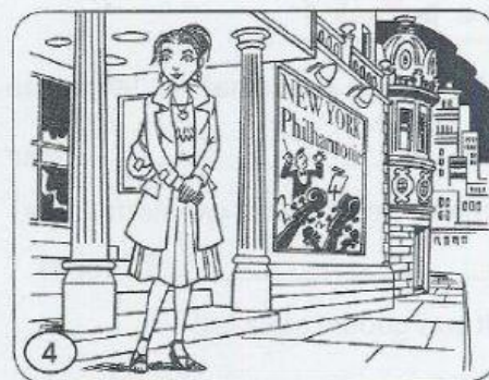
4 A B C D