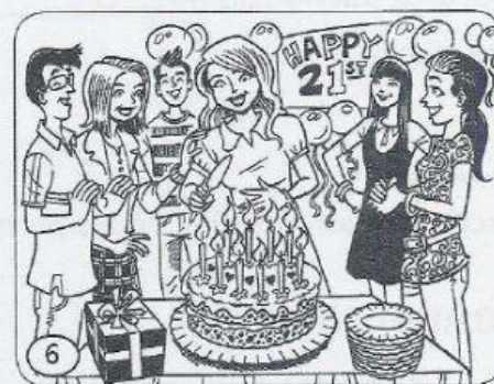
6 A B C D