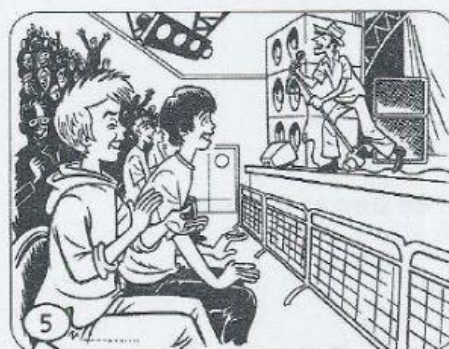
5 A B C D