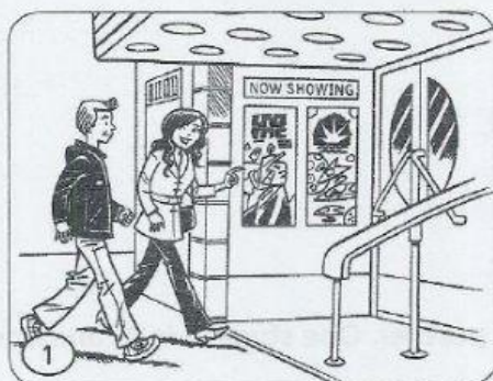
1 A B C D

Look at the pictures. For each picture you will hear a question and four statements. Choose the statement that best matches the picture.