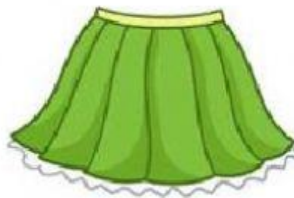
5. S _____