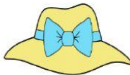
8. H _____