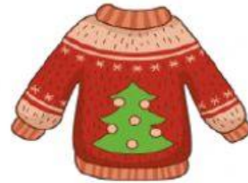
3. J _____