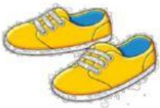
7. S _____