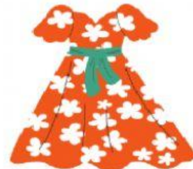
9. D _____