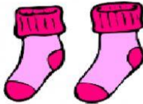
2. S _____