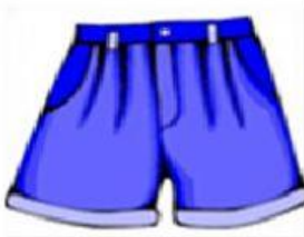
4. S _____