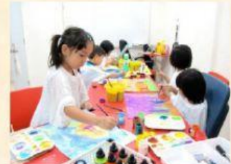
ARTS AND CRAFTS ROOM