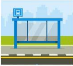
1. bus stop

1) Study the words. Spelling test on Friday, June 24th.