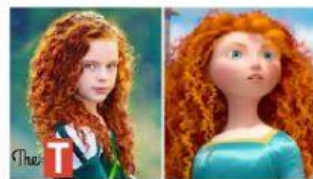
12. look like