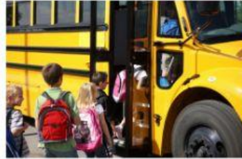
3. get on a bus