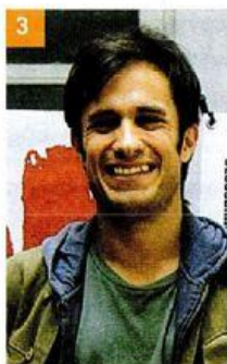
Gael García Bernal