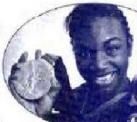
Claressa with her medal

I 4 have two Olympic gold medals, one from London and one from Rio. I 5 am the first American boxer to win two Olympic golds. I 6 want to win more gold medals. I 7 like boxing, it's fantastic!