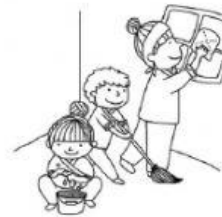
helped each other