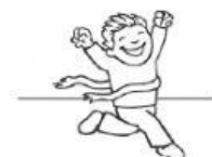
track and field