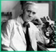
Alexander Fleming (1881-1955)