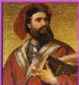
Marco Polo ( 1254-1324)