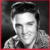
Elvis Presley (1935 - 1977)