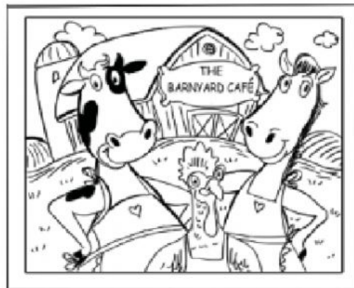
Horse, Rooster, and Cow opened the Barnyard Café.

Farmer Ray thought for a moment. "I'm with my friends. I am doing what I love. My wish has already come true."