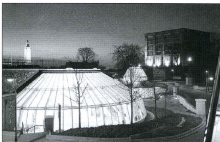
The Castle Mall shopping centre, seen from outside and inside

Now the city's attractions include another important development, a modern shopping centre called 'The Castle Mall'. The people of Norwich lived with a very large hole in the middle of their city for over two years, as builders dug up the main car park. Lorries moved nearly a million tons of earth so that the roof of the Mall could become a city centre park, with attractive water pools and hundreds of trees. But the local people are really pleased that the old open market remains, right in the heart of the city and next to the new development. Both areas continue to do good business, proving that Norwich has managed to mix the best of the old and the new.