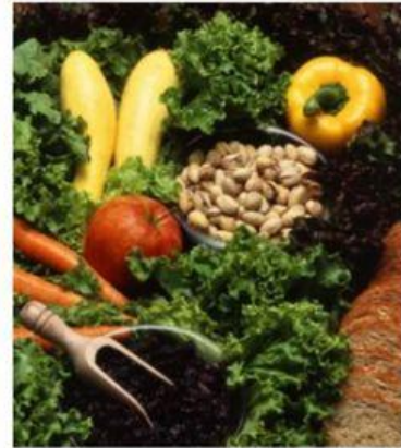
This photo by S. Bauer is licensed under Public Domain