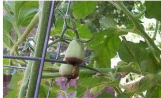
This photo, modified from an image by Sirtloam is licensed under Public Domain