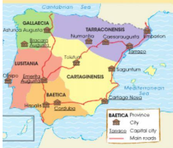
Roman provinces in Hispania in the 3rd century

The Romans divided Hispania into provinces . A Roman governor ruled each one.