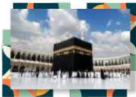
Magnificent, Safe, Amazing, Cultural