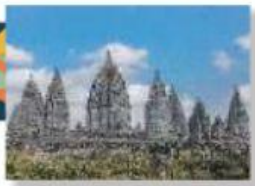
Prambanan Temple, (DIY) Yogyakarta

1. Write the name of these famous place and structures. What city are they in?