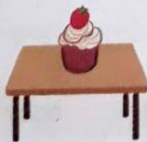
table baby grapes cake