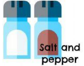
Salt and pepper