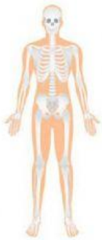
skeletal system human body