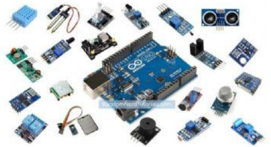
Microcontroller and sensors