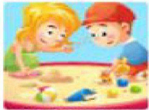
sand in the eyes