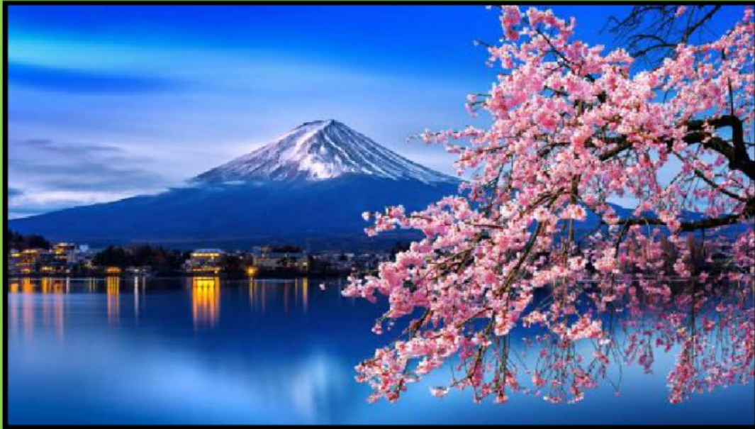
Mt. Fuji and cherry blossoms in spring

Japan is located in eastern Asia. It is a large group of islands (archipelago) that stretch from the Sea of Japan to the Pacific Ocean. Scenery in Japan is varied, with mountains, volcanoes and plains, all surrounded by the sea. Earthquakes are frequent in Japan. Earthquake tremors can shake buildings and houses, causing them to become damaged or destroyed. Despite this, there are many tall buildings in Japan. The highest building in Japan is the Tokyo Sky Tree (2080 ft) . Architects and engineers make sure that the buildings can withstand earthquakes by being flexible. A building made out of concrete will crack under pressure. Buildings made with metals such as steel are considered better because they can easily bend and are flexible. They can sway when hit by an earthquake but do not collapse as easily. In Japan, architects use concrete reinforced with steel to build tall structures. Many Japanese homes that are made from wood are no higher than two floors. This means when an earthquake strikes there will be less falling debris. In most Japanese homes, there is a mixture of traditional and modern furniture.