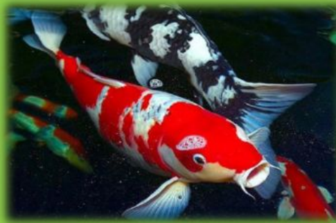
Japanese Koi carp fish