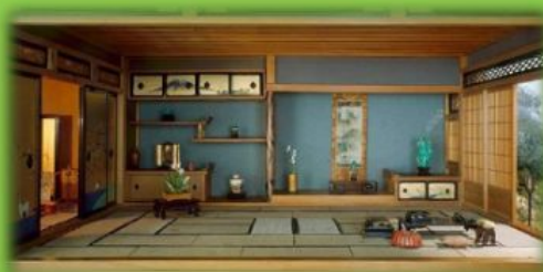
Traditional Japanese house