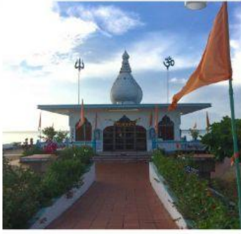
Temple in the Sea

8. Select pictures of the Landmarks in Trinidad.