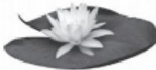
Water lily plant