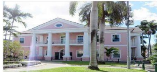
Supreme Court Building, Nassau

SECTION A: Fill in the blank. Select the correct word from the box and write it on the line to match each definition clue. (1 point each).