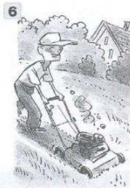
work in the yard