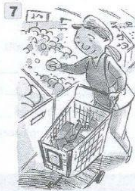
shop for groceries