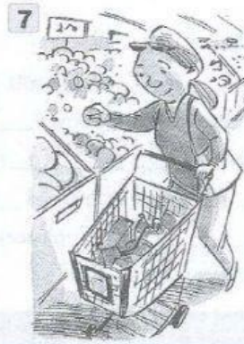
shop for groceries