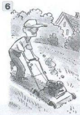
work in the yard