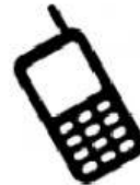
a cell phone