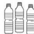
bottles of water