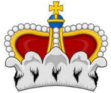
Emperor of the Byzantine Empire