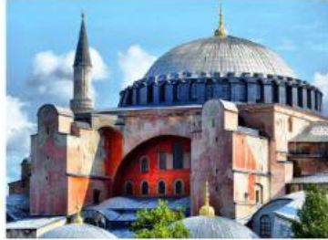
Rebuilt the Hagia Sophia