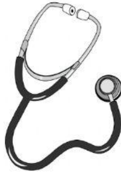
A Roman doctor