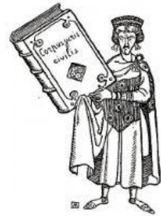
Created a set of laws