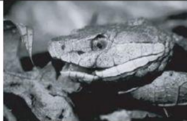
A copperhead snake has poison in its fangs.