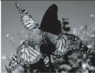
The monarch butterfly's colors warn predators to stay away.

Predators may be strong and have keen eyes and sharp claws and teeth. But nature has given their prey different ways to hide or fight back. Most animals, even very small ones, are not totally helpless. Whether they are hiding, fighting, or spitting poison, animals that are prey can make the hunt very difficult for a hungry predator.