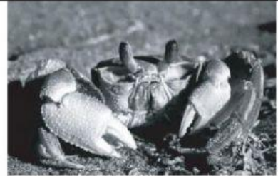
This crab's hard shell is its skeleton.