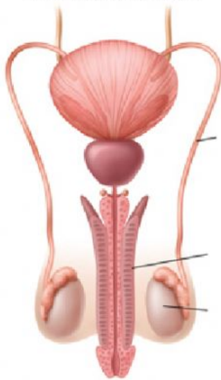
Male Reproductive System