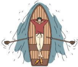
sailing the boat