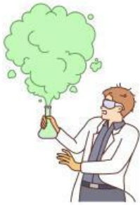
doing an experiment