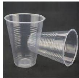
Plastic cup or Cut plastic bottle in half