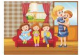
Enjoy family time

It's important to stay calm and relax and enjoy your family time .