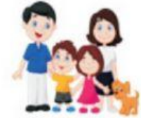
Stay calm and relax

If you want to strengthen your immune system you can