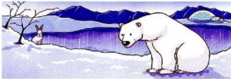
Animals in cold parts of the world

Read the text. Choose the right words and write them on the lines.