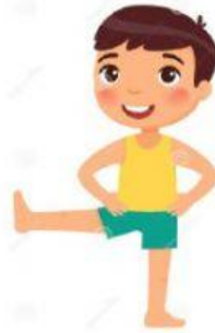
do mringno exciseer