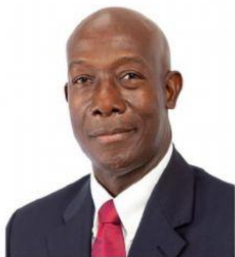
Dr. Keith Rowley

3. The president of Trinidad and Tobago is