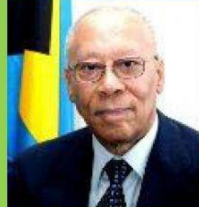
Sir Arthur Foulkes