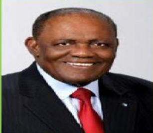
Hon. Hubert Ingraham