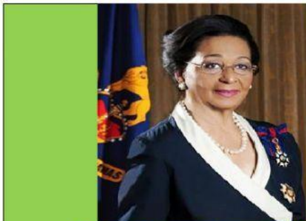
Dame Marguerite Pindling

16. Select the photos of two former Governor Generals of The Bahamas. [2]