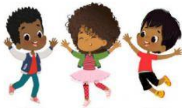
By dancing and partying with friends