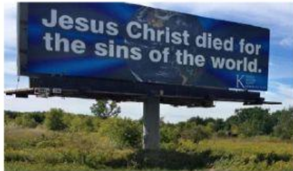
Print media: share the message on a billboard.