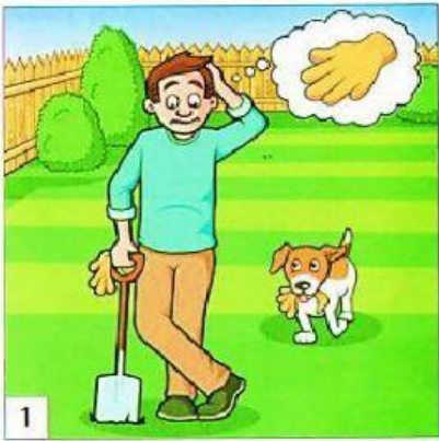
A very good dog