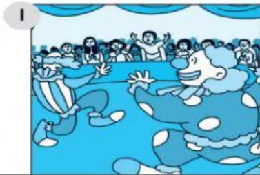
spectators – benches – patiently – show