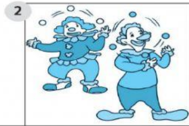
clowns – jugglers – balls